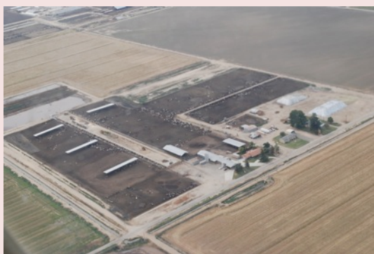
Cattle feedlot in Greeley, CO

Providing information to the agricultural industry: By working with key academic and industry partners in Colorado, this research is identifying the causes of day-to-day variability in emissions, providing information on best management practices that simultaneously minimize the climate, air quality, visibility, and stratospheric ozone layer impacts of agricultural emissions to air.