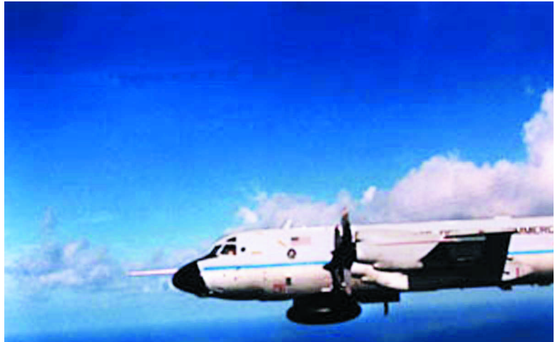
Aircraft such as NOAA's P-3 "Hurricane Hunter" are used to collect data in the Nashville Air Quality Study.

The goal of the 1999 Nashville/Middle Tennessee Air Quality Study is to conduct policy-relevant air quality research to further the scientific understanding of tropospheric ozone and fine particle air pollution and, in so doing, provide improved tools for the assessment and development of efficient and cost-effective air quality management strategies.