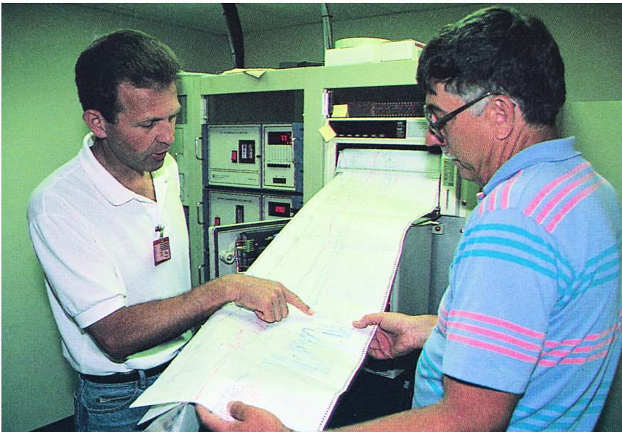
Researchers check data at each monitoring station.